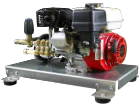
Skid Base Model