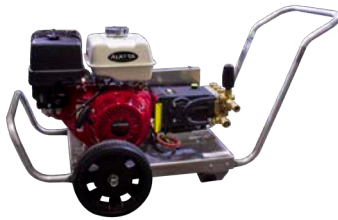
445CSBV Belt Drive Model