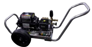
Electric 216CSE & 320CSE Direct Drive Model