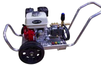
325CS Direct Drive Model